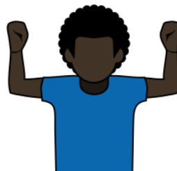
10. Pick Pick

Elbow down forearm vertical index finger pointing upward