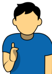
9. Disc up Up

Index finger straight arm pointing down at 45 degree