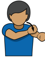
1. Foul Foul

Hold one arm straight out and chop the other forearm across the straight arm