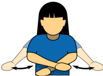
6. Retracted / Play On Retracted, Play On

Forearms extended in front of body, elbows tight against torso with palms facing upwards