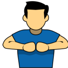
4. Contest Contest

Raise both arms, fully extended, straight up, palms facing inwards