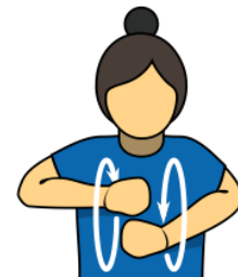
11. Travel Travel

Arms raised, elbows bent, fists facing head