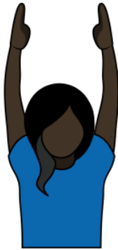
3. Goal Goal

Hands above head forming a V, closed fists