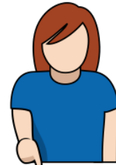
8. Disc down Down

Point with one arm extended, flat palm, thumb parallel to fingers, towards playing field (in) or away from playing field (out)