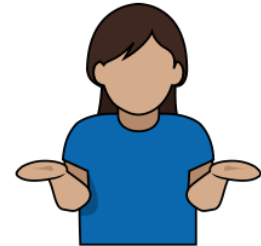
5. Uncontested Uncontested

Two fists bumped together in front of chest, back of hands facing outward