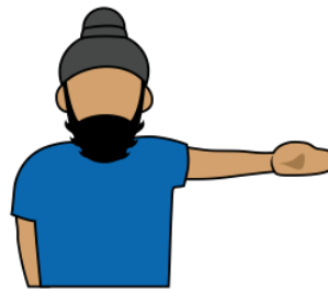
7. In / Out-of-bounds – Out of end zone In, Out

Sweeping crossover motion with both arms extended down in front of body