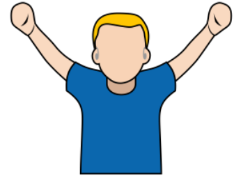
2. Violation Violation

Hold one arm straight out and chop the other forearm across the straight arm